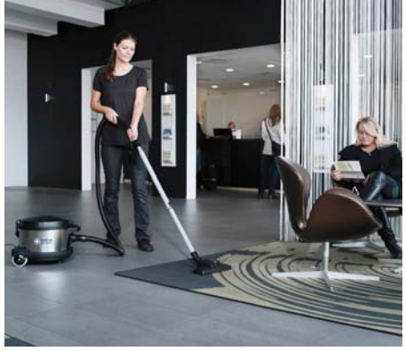
The new GD 930Q is specially built for noise sensitive areas with a low comforting background sound pressure level of only 42 dB(A)