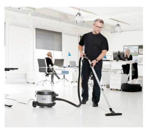
The GD 930 is the perfect choice for demanding applications such as offices, hotels and public buildings