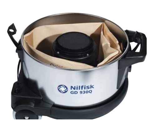
Durable steel container and 15 litre dust bag