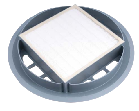
HEPA H13 filter capable of caturing 99.997% of particles down to 0.3 microns \,